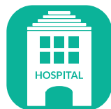
HOSPITALS NURSING HOMES